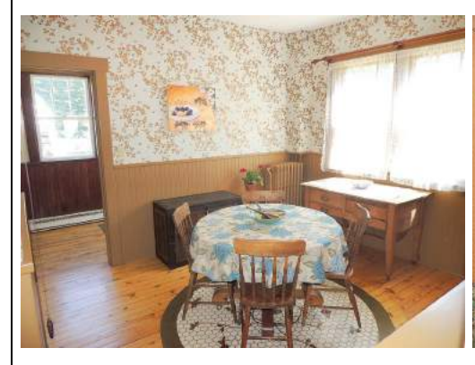
PID # 60060605