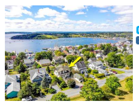
Virt Tour URL