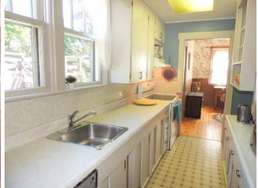
Data provided by the Nova Scotia Association of REALTORS®.