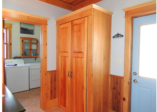
Data provided by the Nova Scotia Association of REALTORS®.