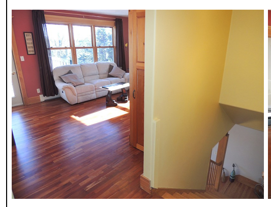
PID # 60196623