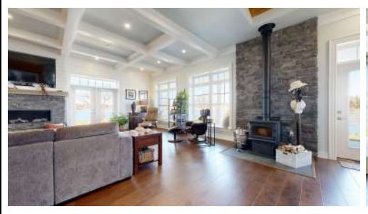
Address 105 Driftwood Court