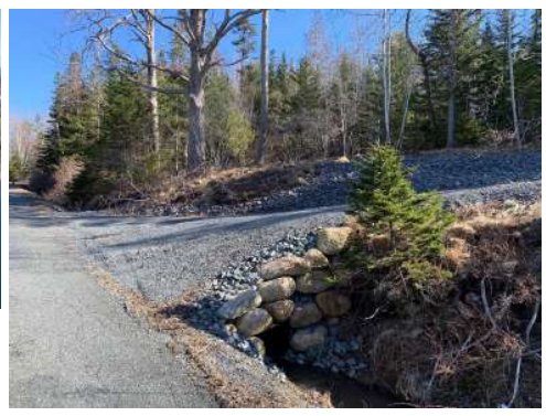
Data provided by the Nova Scotia Association of REALTORS®.