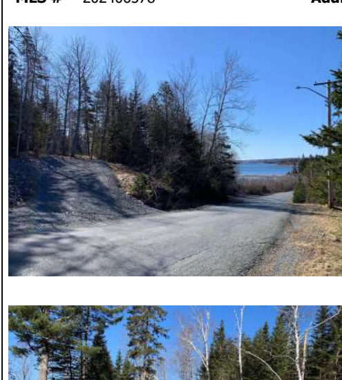
Address Lot 00-4 Mason's Beach Road