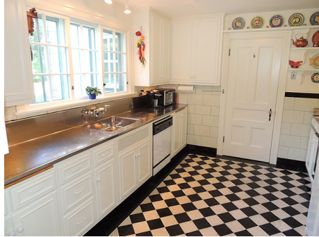
Kitchen w/ Italian glass tiles