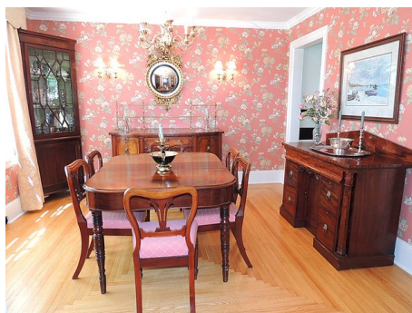
Gorgeous red oak floors