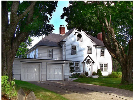
108 Green St - Lunenburg