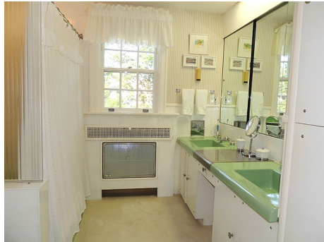
Vintage Master Ensuite