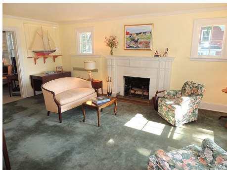
Elegant Living Rm w/ fireplace