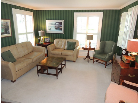
Windows on 3 sides.