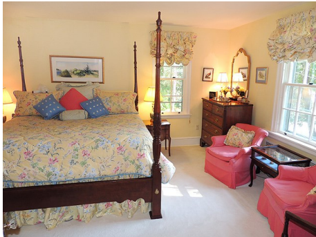
A wonderful sun-filled space.