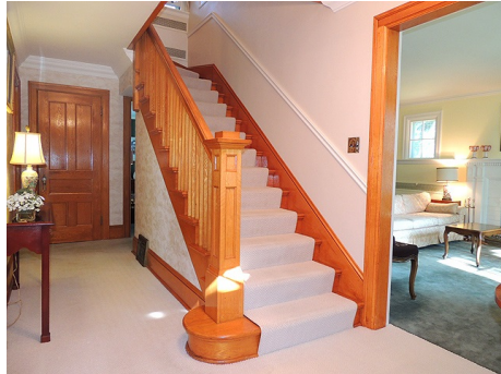
Original Oak Staircase