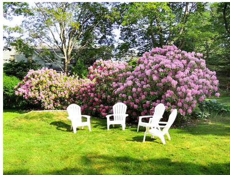
Mature 'Rhodos' in full bloom.