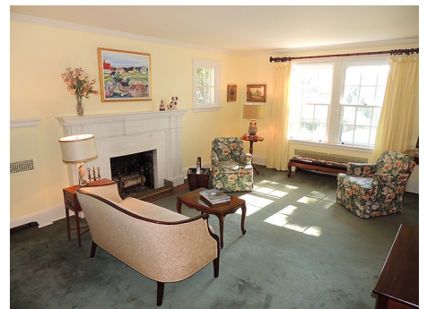
A great entertaining space