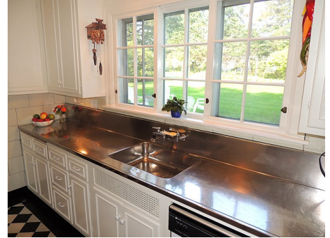
Striking Stainless Countertops