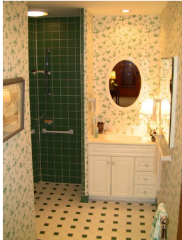
Main floor Full Bath