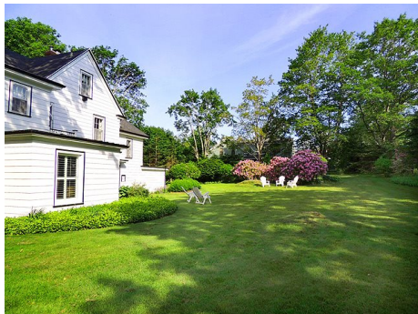
Expansive lawns & mature trees