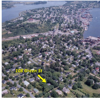
A fine Lunenburg location.