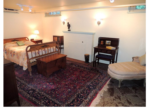
Basement Den or Office space