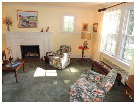
Illuminated with afternoon sun