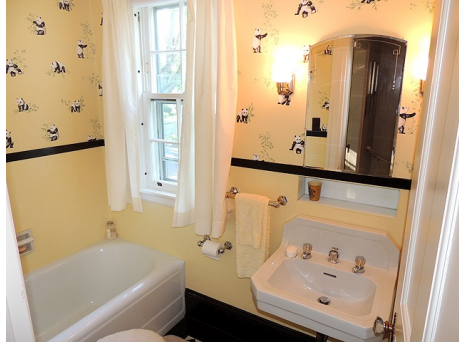
4th Bedroom has its own bath