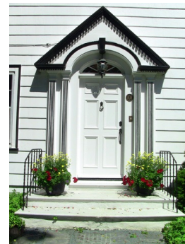
Please Come Inside