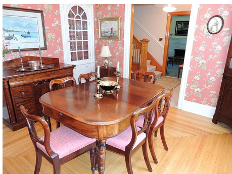
Gracious formal Dining Room