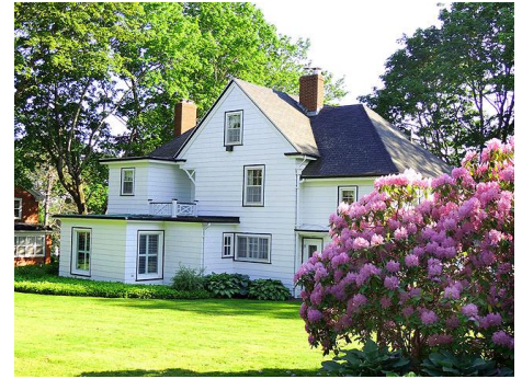
Back of house