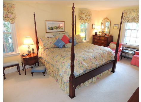
Spacious Master Bedroom