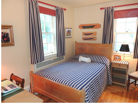
4th Bedroom (above garage)