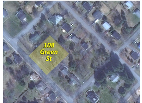
Large 25000 sq ft town lot