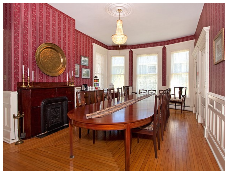
Entertain like never before!