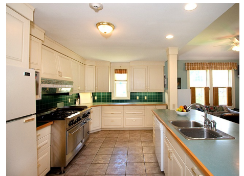
Kitchen w/ commercial range