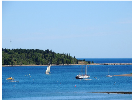
A bird's eye view!