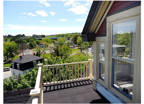
View over Lunenburg