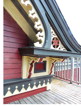
Original 'gingerbread' detail.