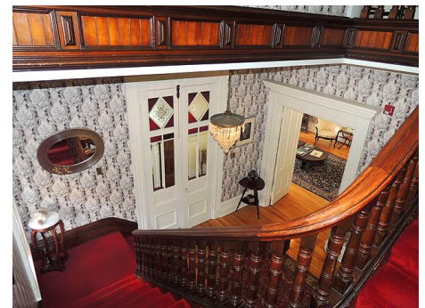
Gorgeous Winding Staircase

Data provided by the Nova Scotia Association of REALTORS® and the Annapolis Valley Real Estate Board