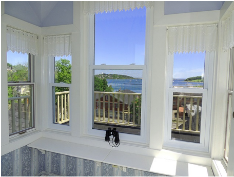
Roof-top 'widow's walk'