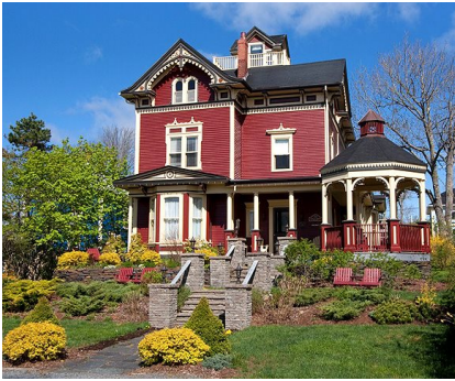
ASHLEA HOUSE ~ 42 Falkland St