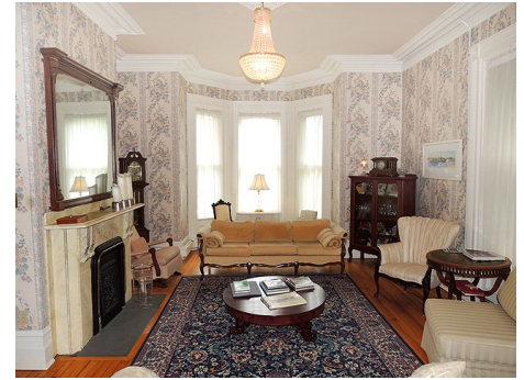
Expansive front Parlour