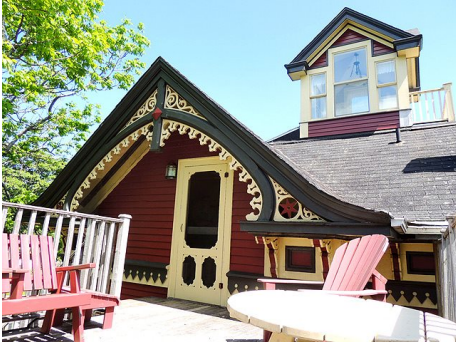
3rd floor walk-out to...