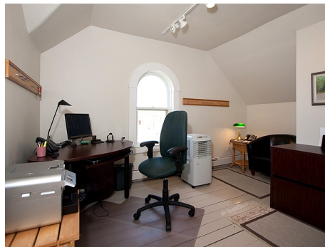
3rd floor office