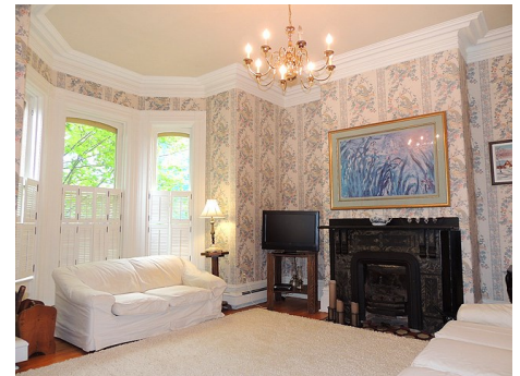
Broad Bay Windows in Parlours