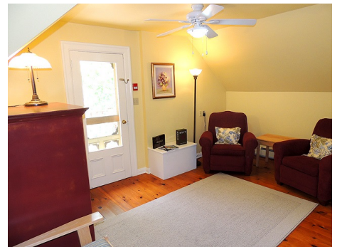
3rd floor Sitting Room/Den