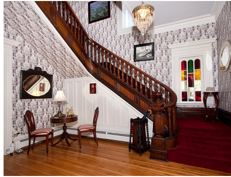
Magnificent front foyer