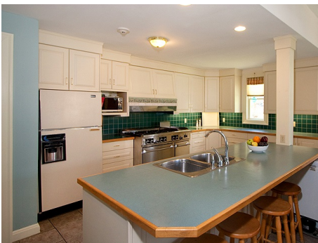
Large central island