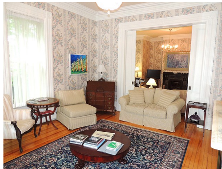
Tall Pocket Doors