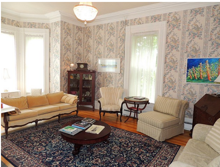
11' ceilings. Plaster cornices