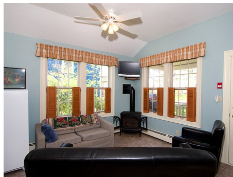
Family Room with woodstove