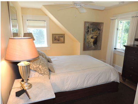
Guest Bedroom #1