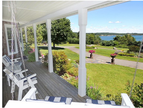
Yourseat on the veranda awaits