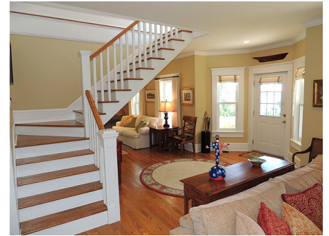
Just inside the front door.