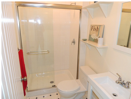
Full Bath in Loft Bedroom