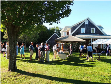
Perfect stage for garden party