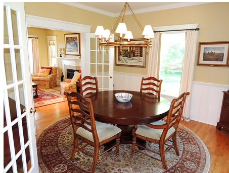
Formal Dining Room w/ Walk-out