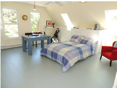
Finished Loft above the garage