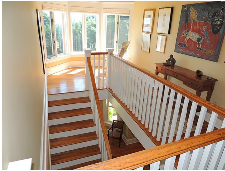
Let's go upstairs shall we?