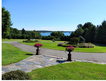
A hilltop estate w ocean views