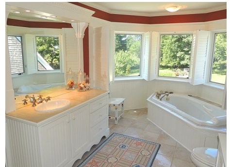
Luxurious Main Bath