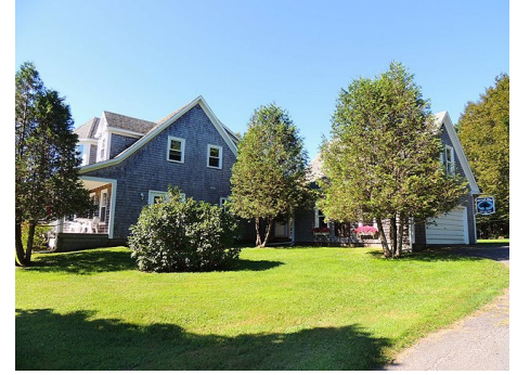
Double Garage w/ Finished Loft