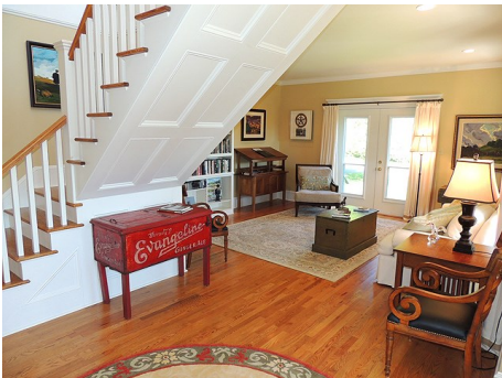
On your right...