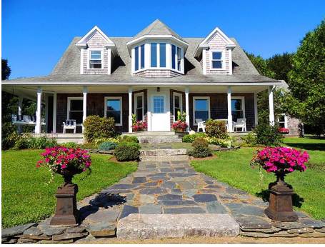
Welcome to Cloud Hill