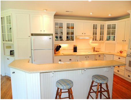
...large island with seating.