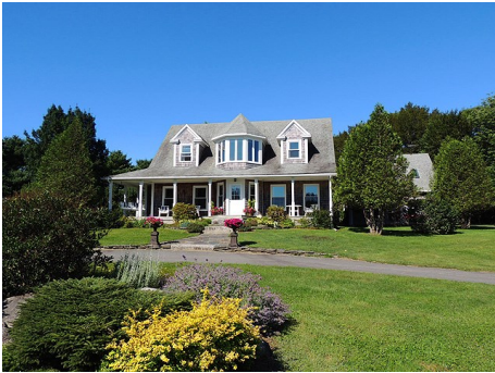
A classic Maritime Residence..