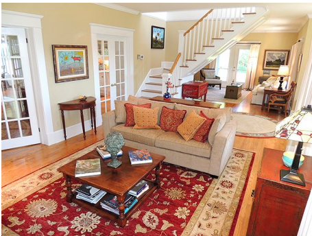
Den opens to Living Room area.