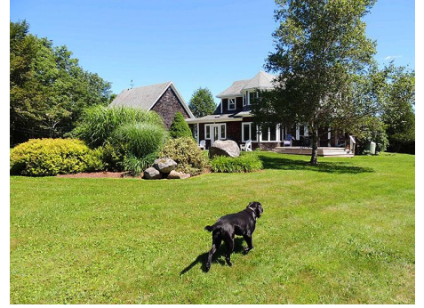
'Where did I hide that bone!?'