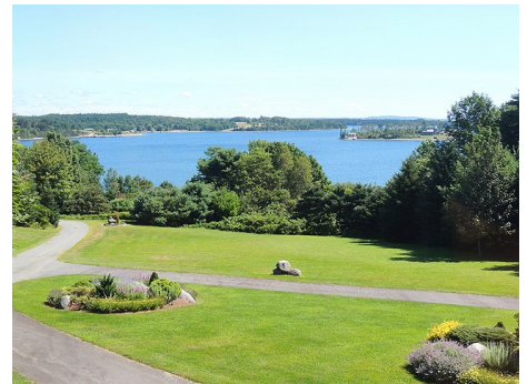
View from Master Bedroom