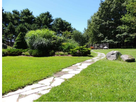
Stone paths and gardens