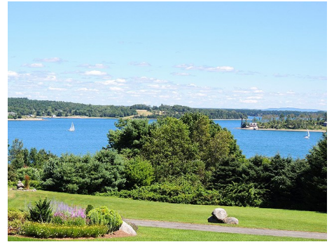
Put yourself into THIS picture