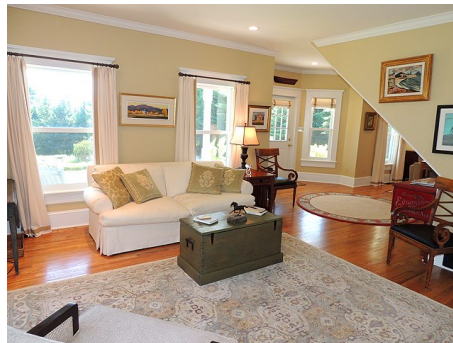
...a spacious Den with...