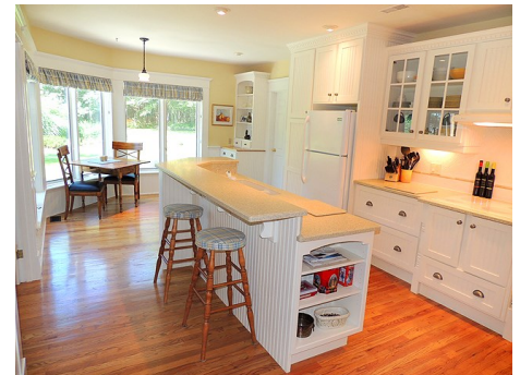
Bright Kitchen with...

Data provided by the Nova Scotia Association of REALTORS®.