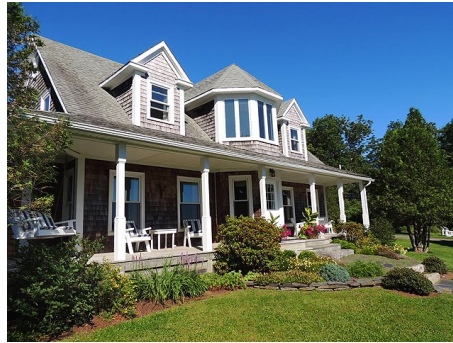
...with wrap-around verandah.