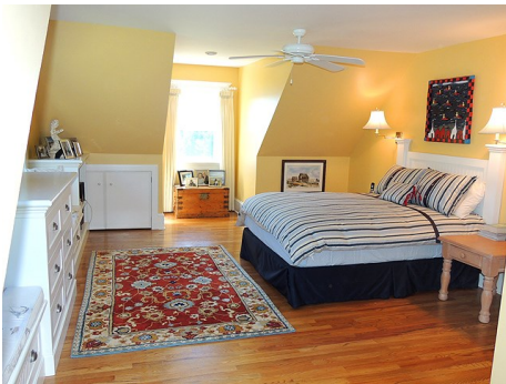
Large Master w/ Walk-in and...