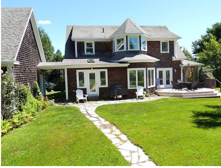
Back of house showing breezeway