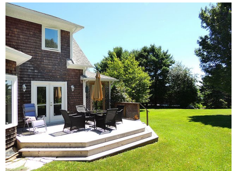
Sun-soaked back deck off D-R