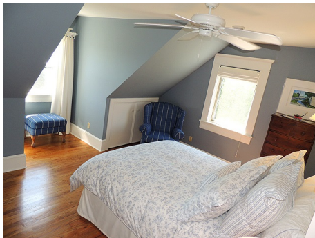
Guest Bedroom #2