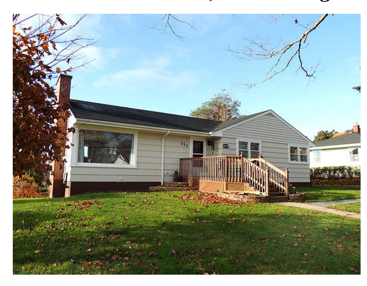
New-Town Bungalow with Flair! $247,500

New-Town Bungalow with flair! Situated in a quiet family-friendly neighbourhood, this updated 3 Bedroom home enjoys a large corner lot, and is easy walking distance to the school, recreation centre and hospital. The fresh interior has enjoyed extensive renovations in recent years, and includes energy-saving upgrades including efficient ductless heat-pump. The spacious open plan main living area is bright with large windows and natural light, yet cozy with its traditional wood-burning fireplace. The Living Room flows to Dining Room with large built-in china cupboard, and the sizable Kitchen has space to accommodate a central island, or dining table. Main floor Laundry is conveniently located at the back entry giving easy access to outdoors for those who prefer line-dried. Additional living space below in the partially finished lower level complete with half bath -- plenty of room for kids, hobbies, office, etc. Outside, there are large lawns in front and back and a sunny deck, 2 paved driveways and in-ground garage, plus a handy garden shed. So, what's left on 'your' checklist?