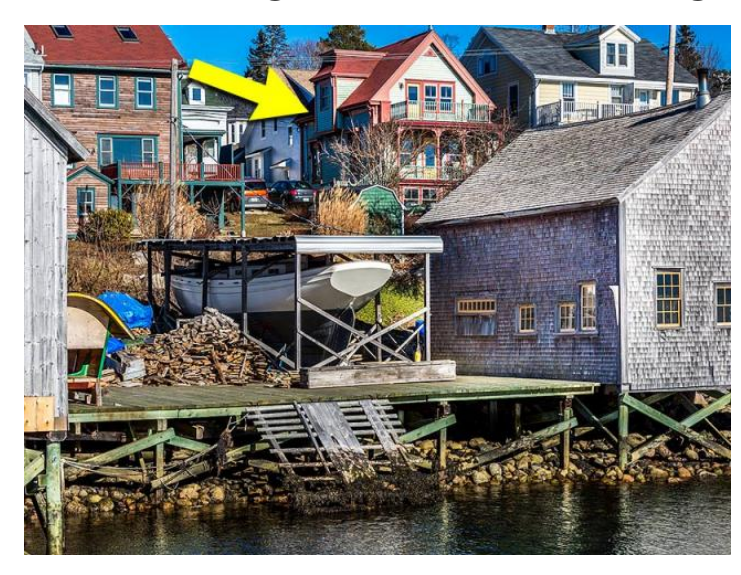
An Outstanding Harbour View! $434,500

Renovated and updated character home in Old-Town Lunenburg, with outstanding panoramic views of Lunenburg Harbour across to Bluenose Golf Club and out to Lunenburg Bay.