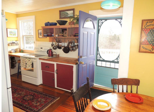
Data provided by the Nova Scotia Association of REALTORS®.