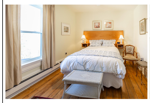
PID # 60589751