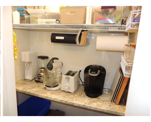
Data provided by the Nova Scotia Association of REALTORS®.