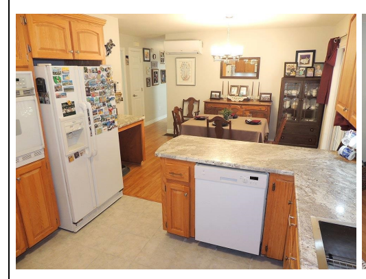
PID # 60387800