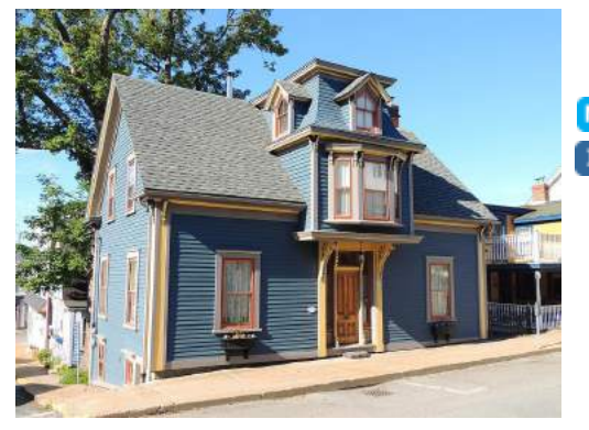
Virt Tour URL