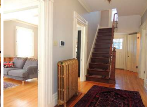
Data provided by the Nova Scotia Association of REALTORS®.