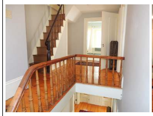
PID # 60061728