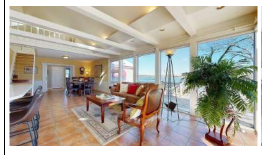
Address 9314 Highway 3