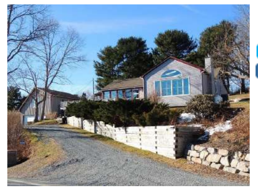
Virt Tour URL