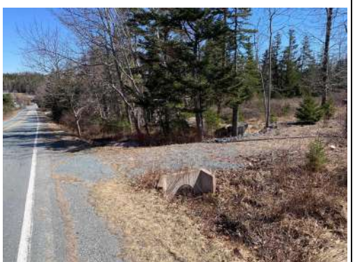
Data provided by the Nova Scotia Association of REALTORS®.