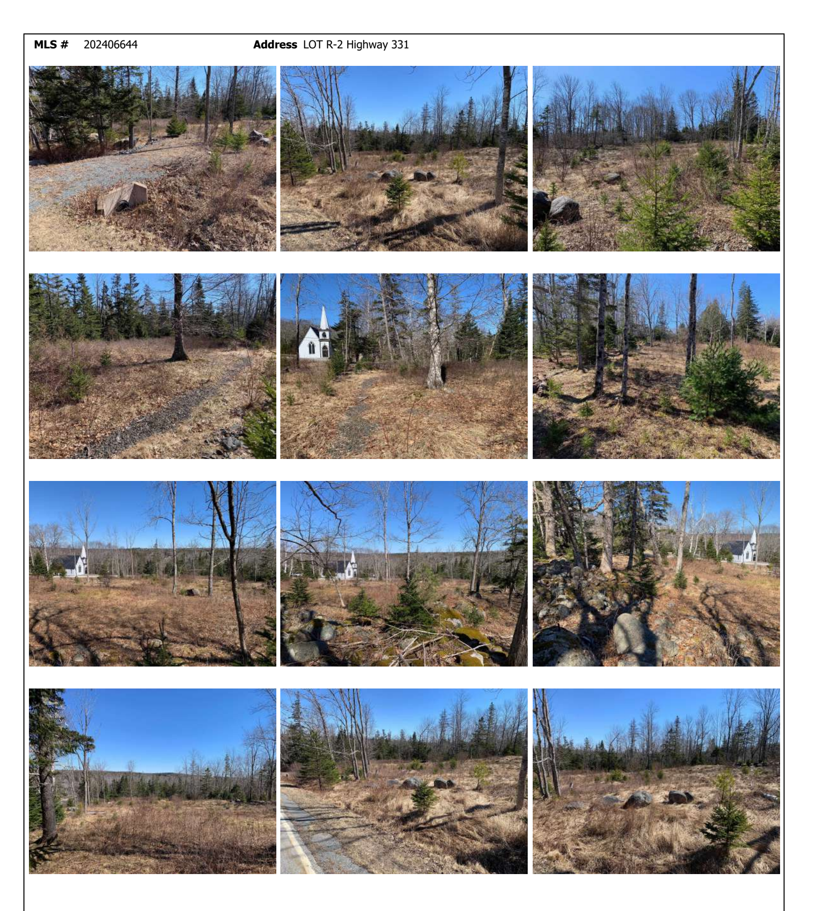
All information displayed is believed to be accurate but is not guaranteed and should be independently verified. No warranties or representations are made of any kind.