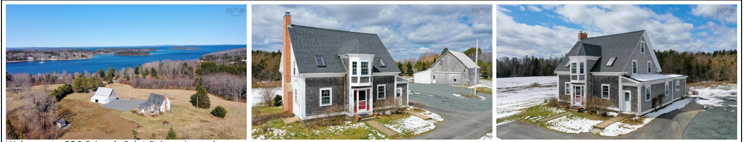
Welcome to 236 Prince's Inlet Drive - Lunenburg

Listing Office: Red Door Realty(Lunenburg)